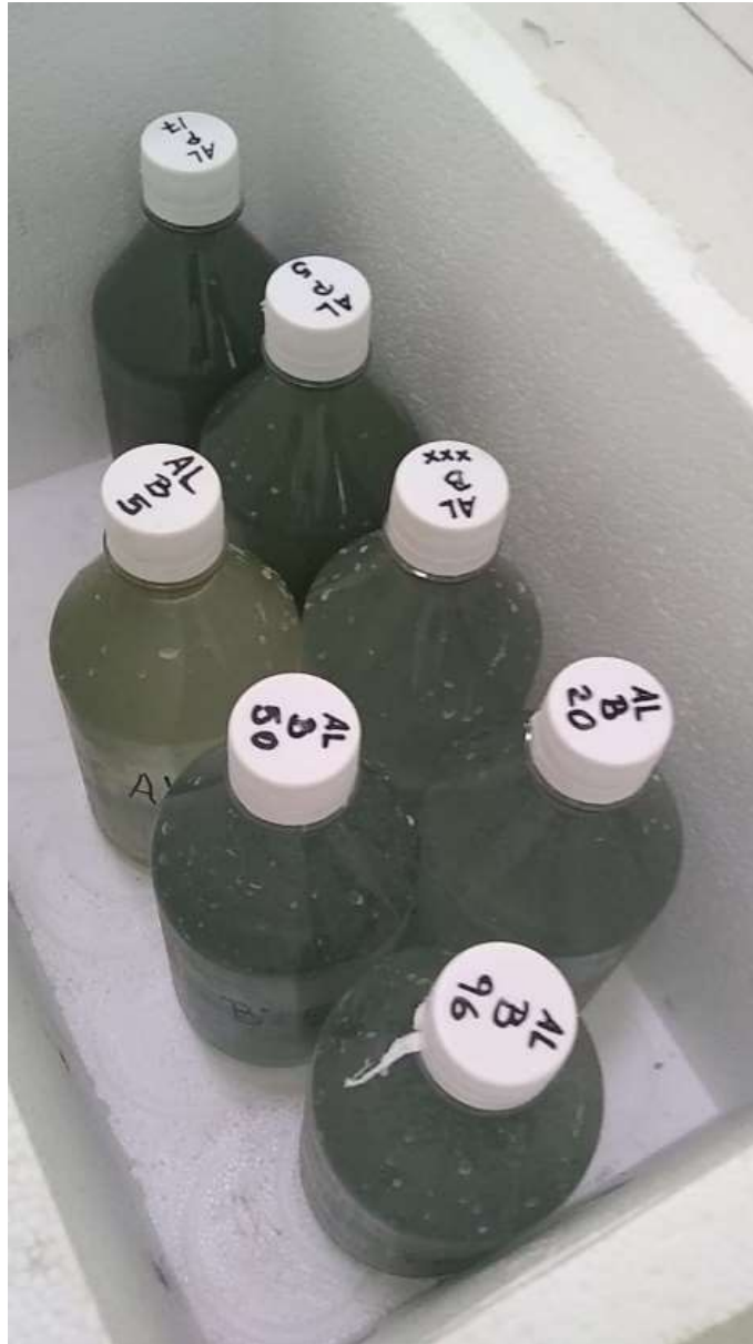
Figure #2 - Brine samples taken to Alex Stewart International, Argentina

In addition to the Company's planned development program on its central Salar de Arizaro Claims, the Company has also received a permit to drill an exploration water well on its southernmost claim on Arizaro. The well will be located in an area where approximately 70% of the freshwater flows into the basin. This will be the first fresh water well to be drilled on the Salar de Arizaro and will give the company a significant advantage when the property moves towards production.