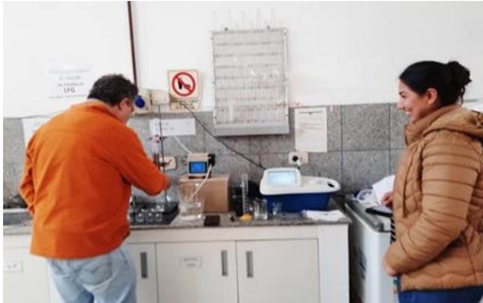
Metallurgy studies conducted on brine collected from the Company's first production well in there recently established lab.

production tests. Lithium Chile is also in the process of shipping brines to Summit Nanotech's facility in Calgary, Alberta for initial analysis.