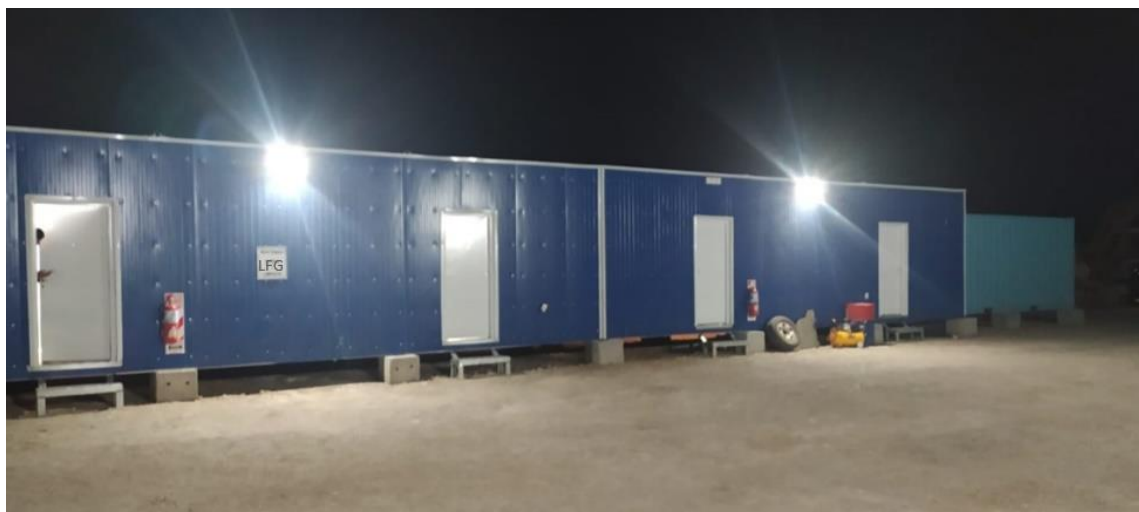
On-site camp at the Salar de Arizaro

The Company's camp on the Salar de Arizaro has been expanded to accommodate 50 employees as a result of significantly expanded operations currently underway. The camp is complete with a kitchen, dining room and health & safety modules. The on-site camp allows for non-stop operations and significantly reduces the Company's travel costs.