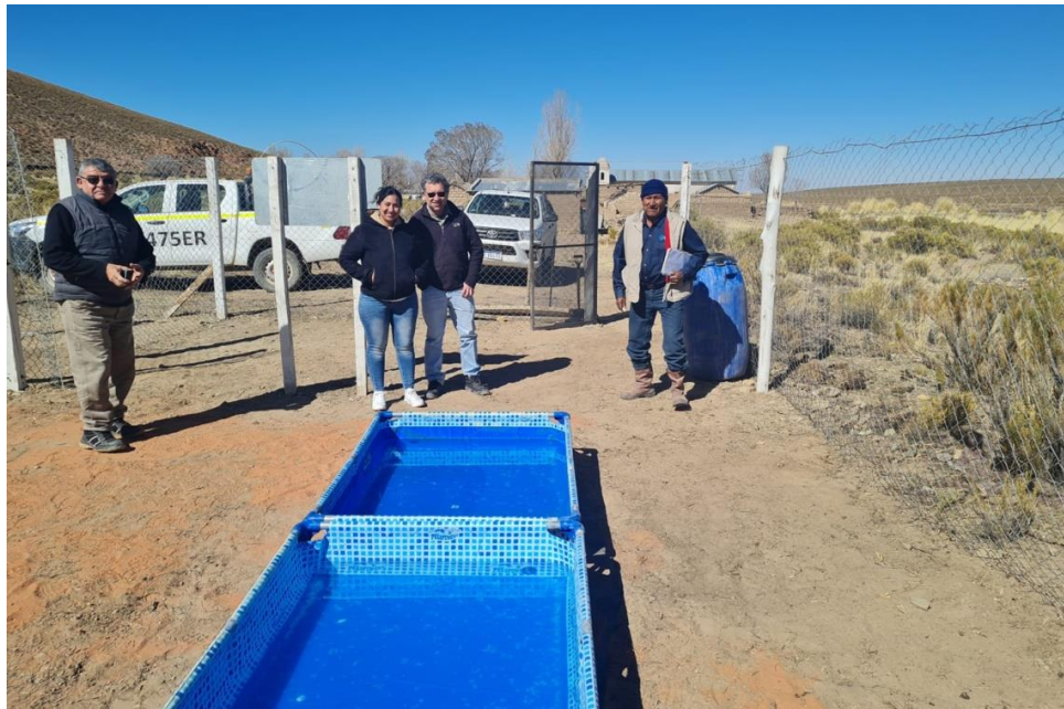
Test evaporation pools to determine best production concentrations using brine collected from the Company's first production well