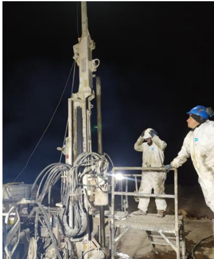
Diamond Drill Rig on the Salar de Arizaro

The third hole, located on the northern extension of the Company's Arizaro claims, is currently at 250 metres. The halite cap appears thinner on the northern claims and consists of broken halite, mixed with sands and was encountered at shallower depths. Sampling has begun using a double packer system to ensure the most accurate results.