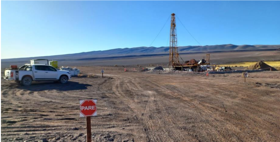
Water Well on the Salar de Arizaro

The Company's first, fresh water well has been drilled, completed, and cased on the southern border of the Salar de Arizaro. Over 100 metres of freshwater aquifer was identified. Testing has now begun on flow rates and recharge rates and this data will be submitted to the Salta Provincial Water Ministry in support of a future application to use a percentage of the water for lithium carbonate production.