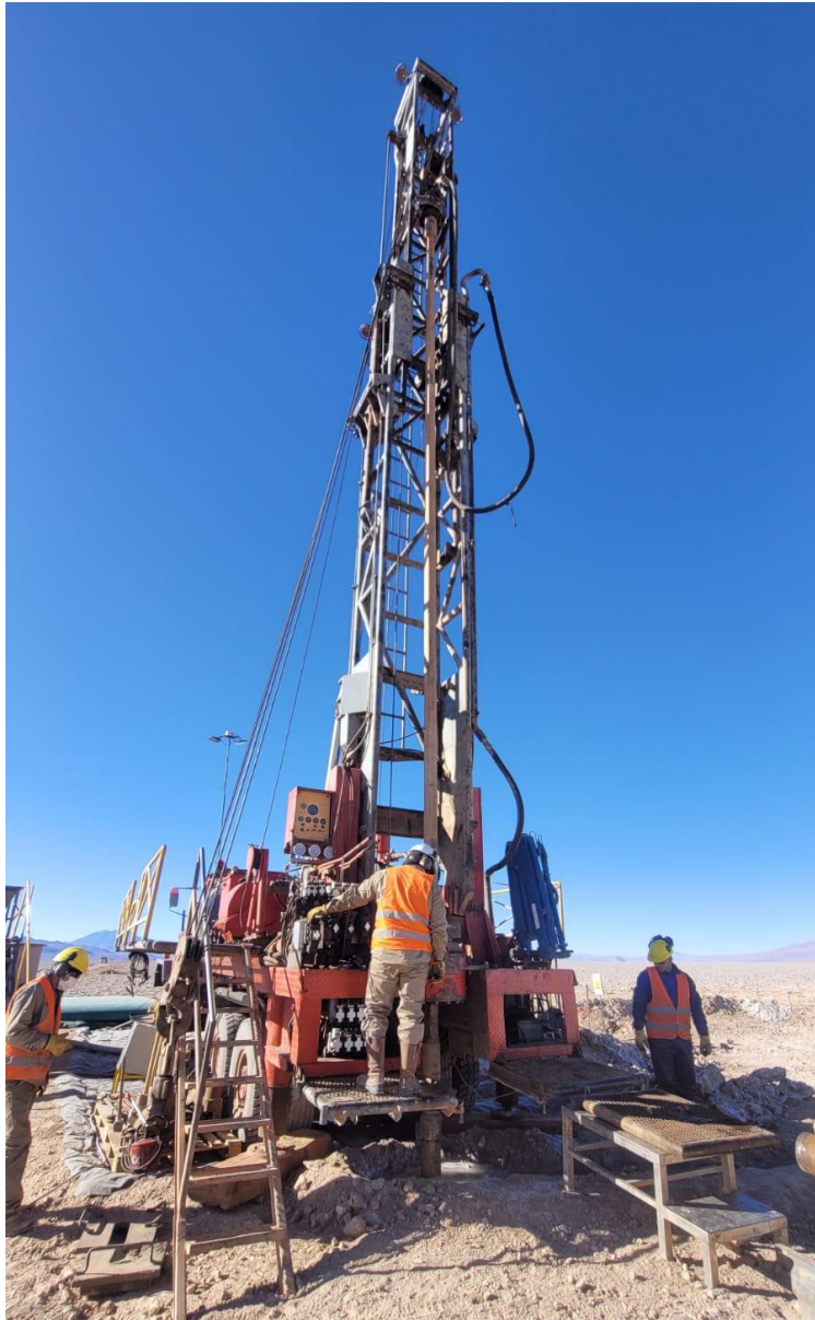
Rotary Rig on the Salar de Arizaro